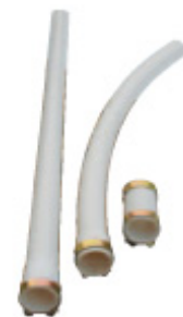
White PVC pipes are rigid and dimensional stable