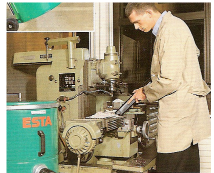
The angled vacuum nozzle can get the dust and dirt even in the smallest crevices